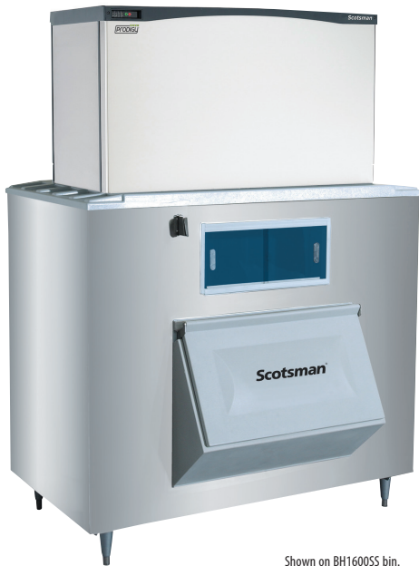
Shown on BH1600SS bin.